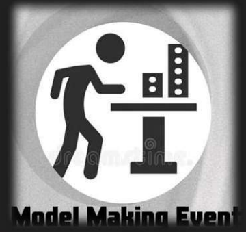
Model Making Event

The event was proven to be creative and students have learned various practical aspects of the civil engineering structure.